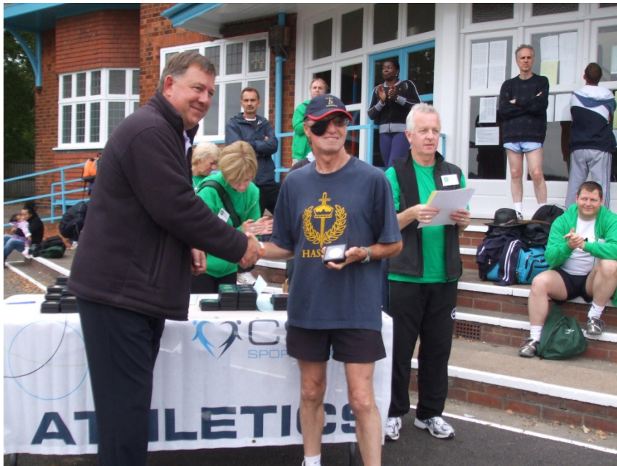
CSSC Games Loughborough Sept 2009