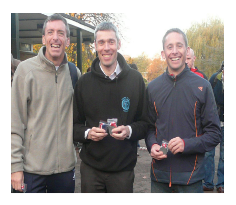
MoD Men at Cross Country